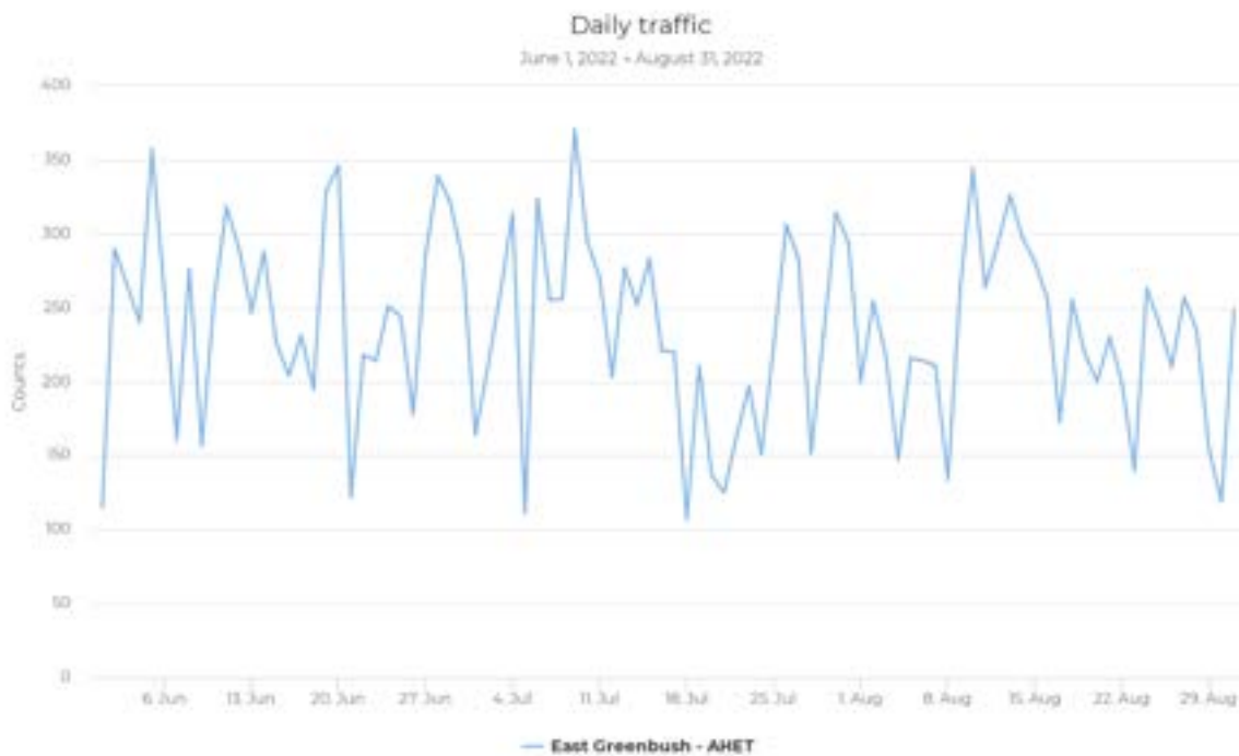
Above: daily AHET visitation from June 1 to August 31 in East Greenbush, illustrating visitation is highly impacted by daily weather conditions (sunny vs. rainy days).

Although AHET visitation follows a predictable seasonal cycle (lowest in winter months, highest from May through September), day-to-day weather greatly influences trail visitation. The graphic below depicts the number of trail users passing the East Greenbush counter each day during the 3-month period from June 1 to August 31, 2022, during the peak summer trail season.