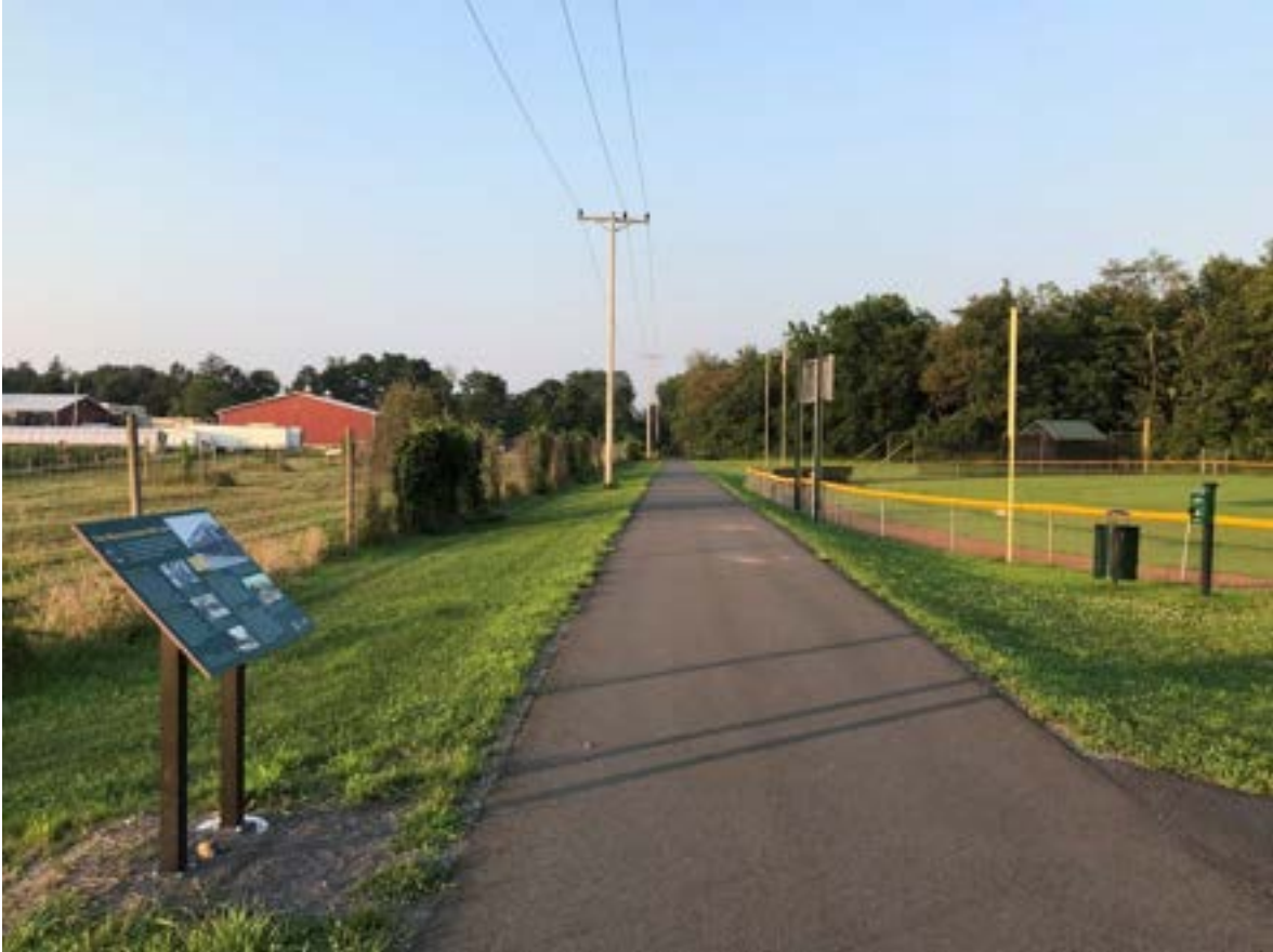
Above: the AHET Trail through Rothermel Park in the Village of Kinderhook.

The Albany-Hudson Electric Trail section in the Village of Kinderhook is a paved, 10-foot wide trail. It is heavily used, drawing local users from the Village, visitors who travel to the trail from the capital district, and long-distance Empire state Trail users from across the nation and other countries.