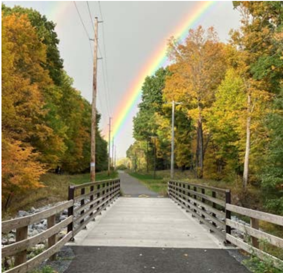
Above: trail bridge over the Valatie Kill in Nassau on a Fall day.

The Albany-Hudson Electric Trail section in the Village and Town of Nassau is a paved, 10-foot wide trail. It draws local users from Nassau, visitors driving to access the trail from the large trailhead parking area on John Street in the Village, and long-distance bicyclists.