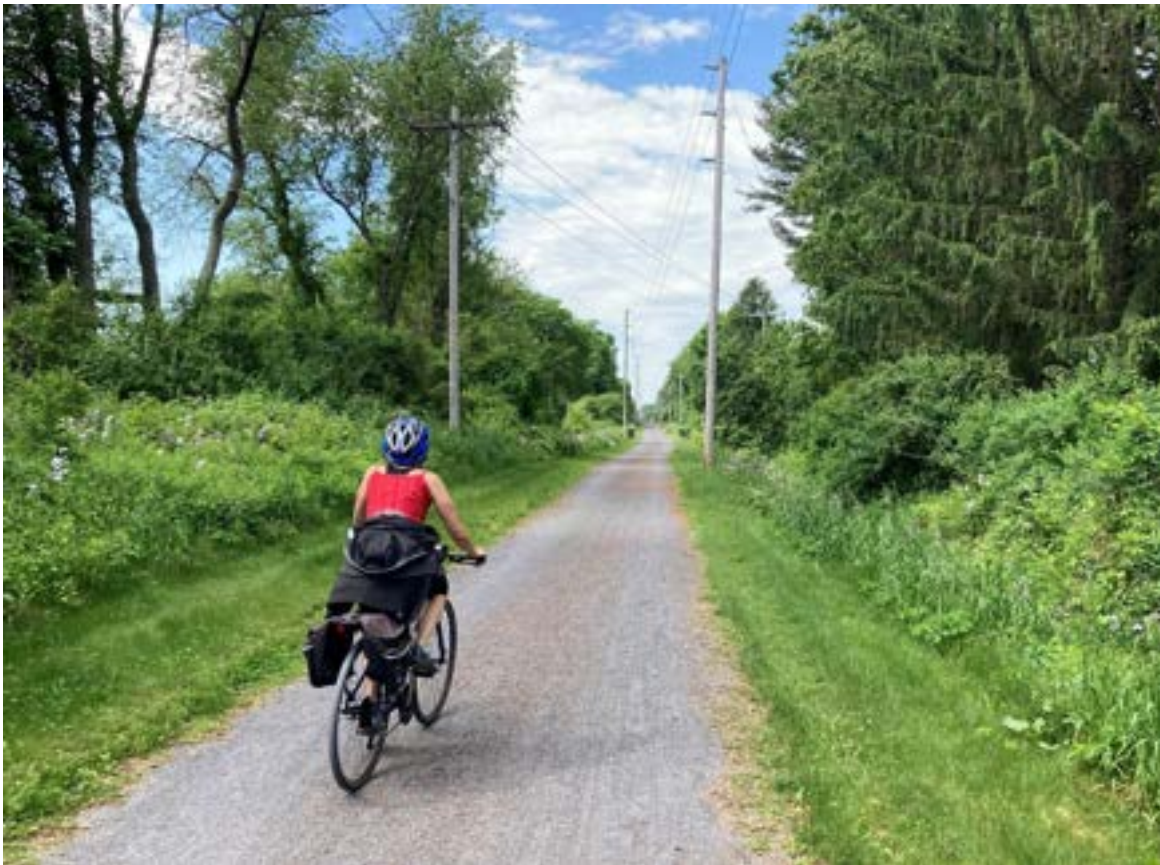
Above: the AHET trail in North Chatham has a compacted stonedust surface.

The Albany-Hudson Electric Trail section in the hamlet of North Chatham is a 10-foot wide trail with a compacted stonedust surface. While it draws local users from the community of North Chatham, most visitors access the trail from the trailhead parking area on Depot Street, or bicycle down the trail from the Village of Nassau (to the north) or Niverville and Kinderhook (to the south).