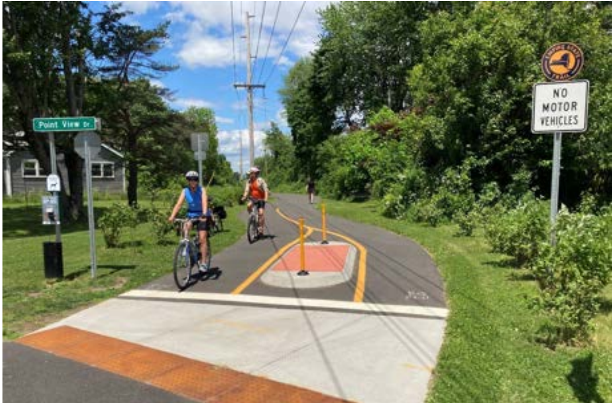
Above: the AHET Trail in East Greenbush, Rensselaer County.

The Albany-Hudson Electric Trail section in the Town of East Greenbush is a paved, 12-foot wide trail. It is heavily used, drawing local users from surrounding residential neighborhoods, visitors who travel to the trail from the capital district, and long-distance Empire state Trail users from across the nation and other countries.